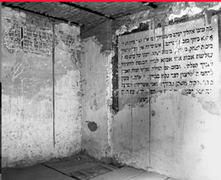
The interior of the Small Synagogue