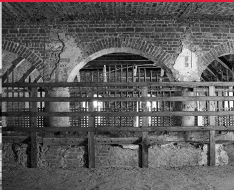
The balcony for women in the Great Synagogue