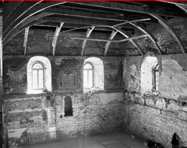
The main hall of the Great Synagogue

synagogue stood probably close to the market; however, no precise information about it has survived. The house of the rabbi was next to it. There was also a Jewish hospital within the town walls, serving at the same time as a hostel for travelers. The cantor lived nearby.