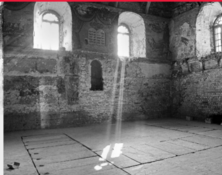
The main hall of the Great Synagogue