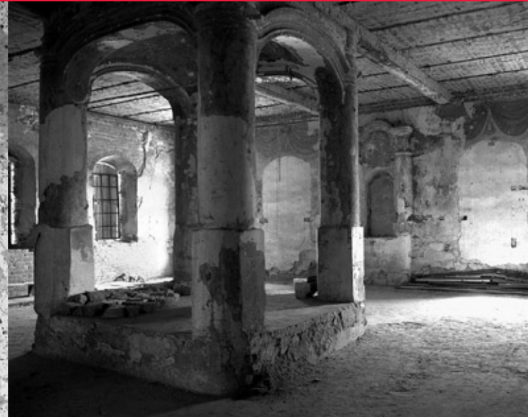
The main hall of the Small Synagogue