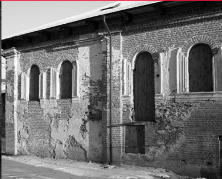
The Great Synagogue