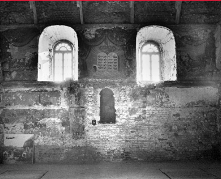
The main hall of the Great Synagogue