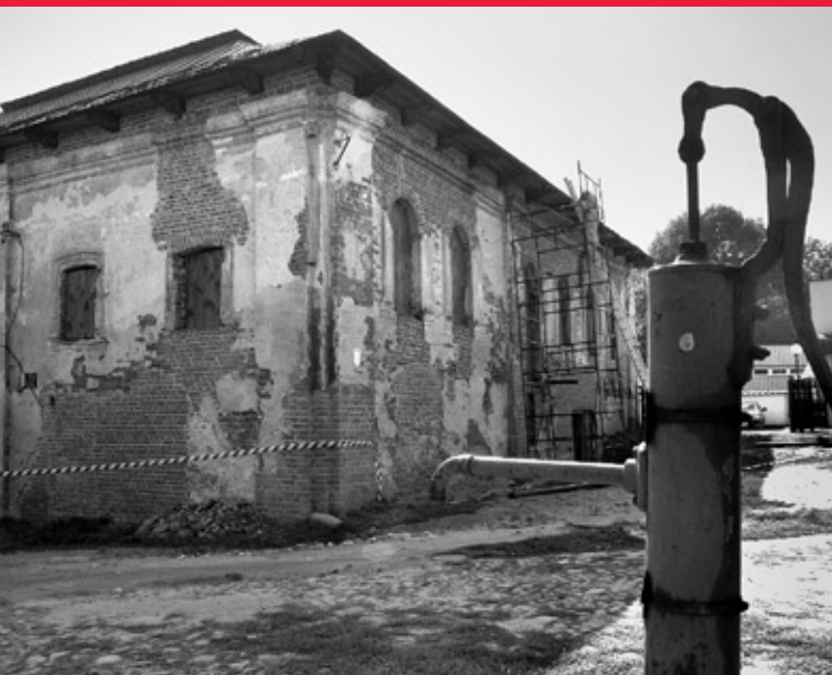
The Great Synagogue