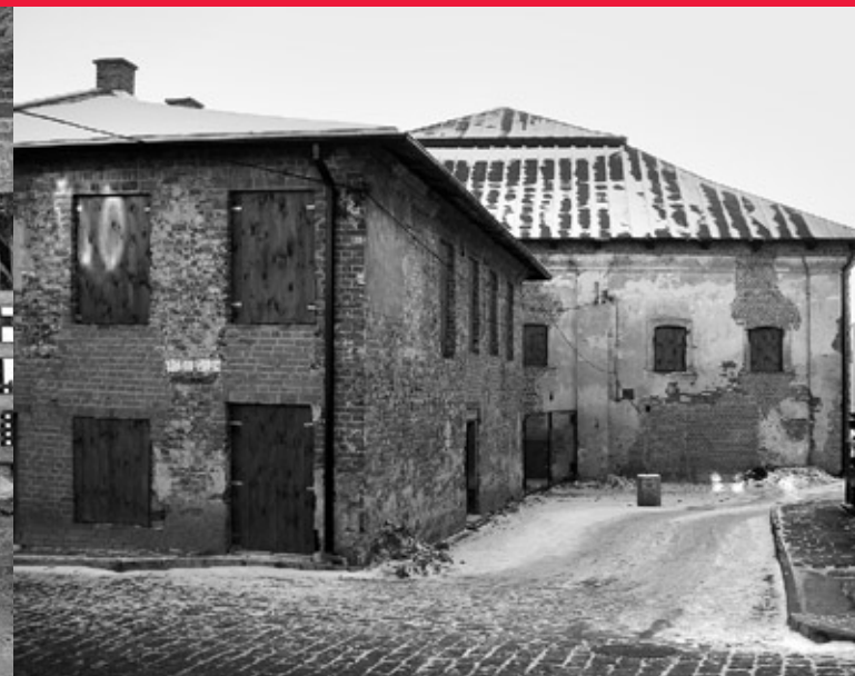
The Small and the Great Synagogues