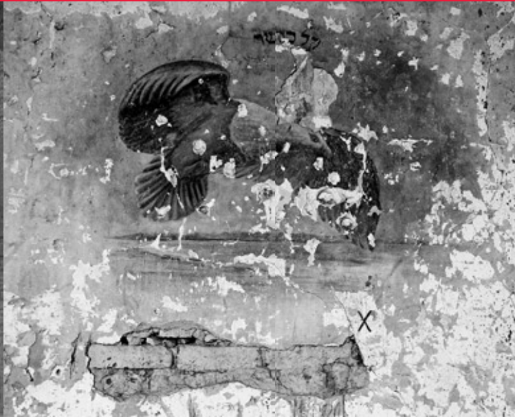
A wall painting in the main hall of the Great Synagogue