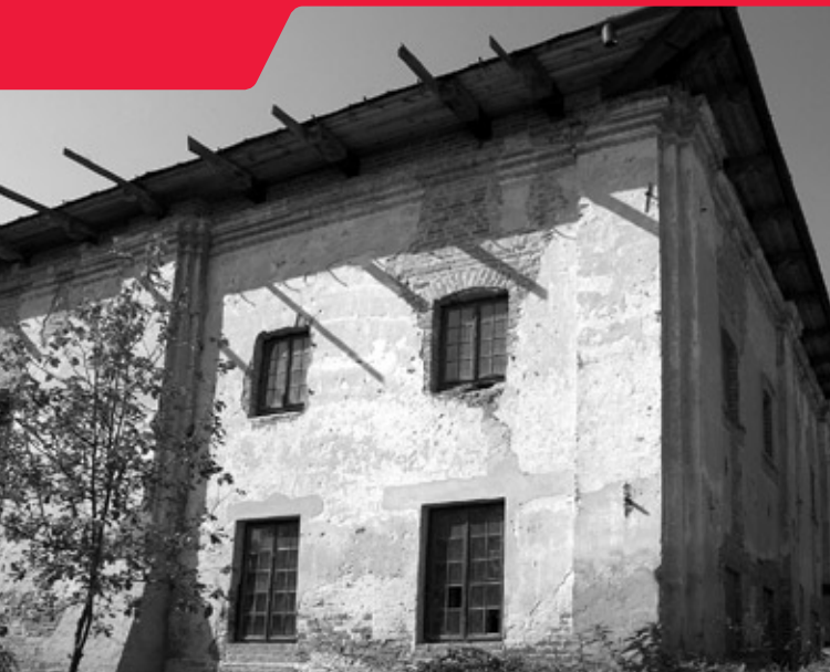
The Great Synagogue