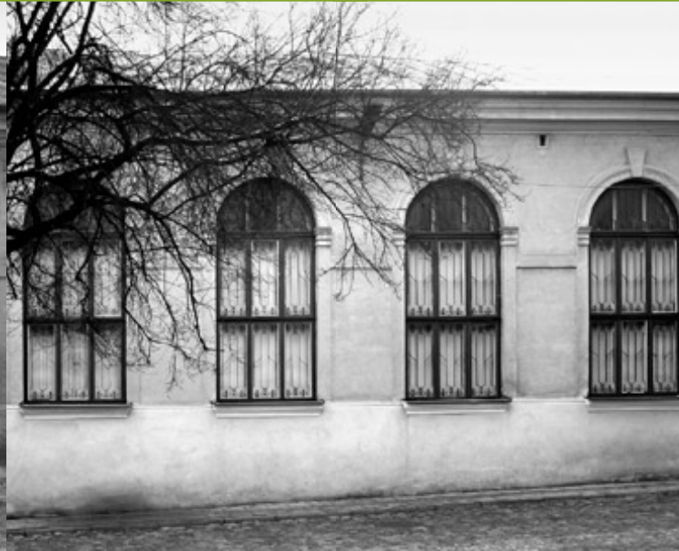
The new synagogue