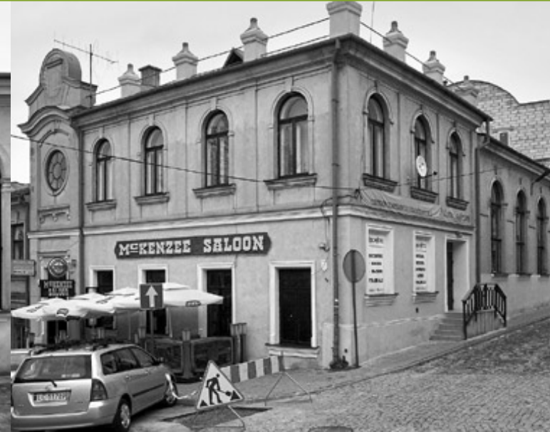
The new synagogue, present condition

All roads lead to Chełm, All the world is one big Chełm Isaac Bashevis Singer