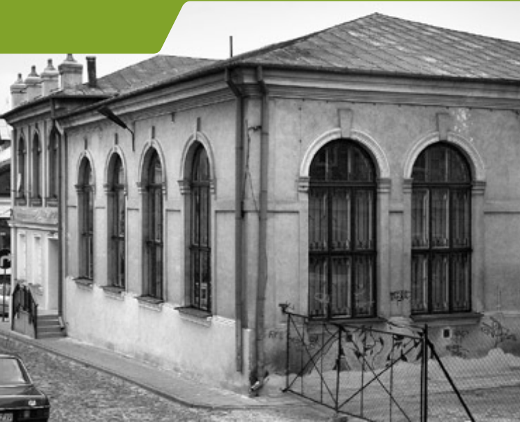
The new synagogue