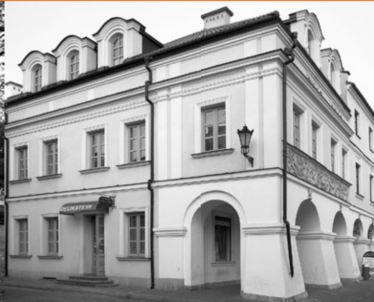
The former house of the rabbi