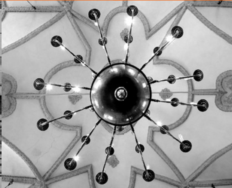
The vault of the main hall in the Old City synagogue