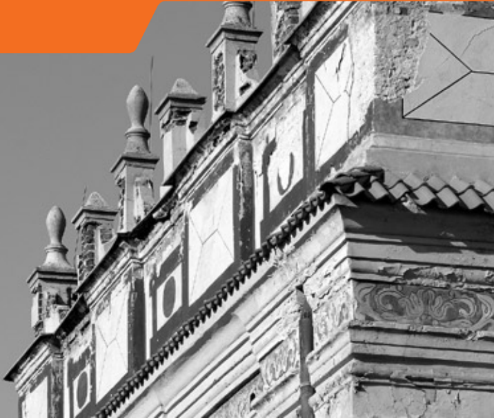
The attic of the Old City synagogue