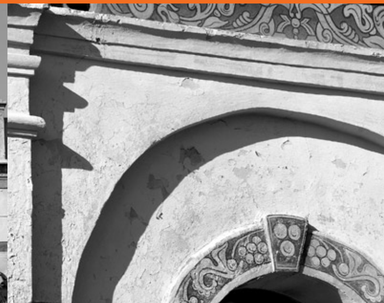
The elevation of the Old City synagogue

At the time the Jewish community constituted the majority of the population of the town. In 1827 out of 5,414 citizens there were 2,874 Jews, which comprised 53% of all the inhabitants. In 1857 there were 2,490 Jews out of 4,035 citizens. In 1897 7,034 Jews lived in Zamość, which made 62% of the total number of the town inhabitants.