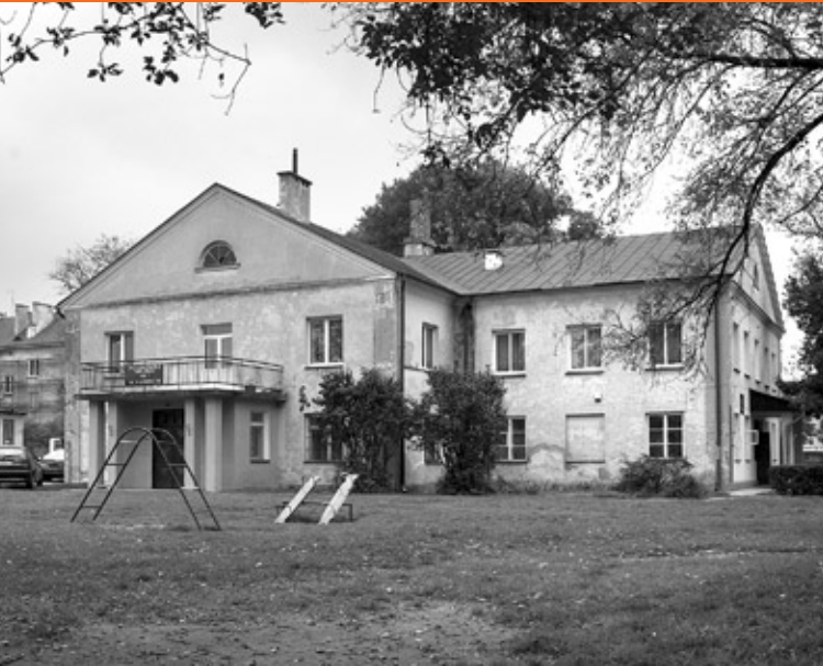
The New Town synagogue, today a kindergarten