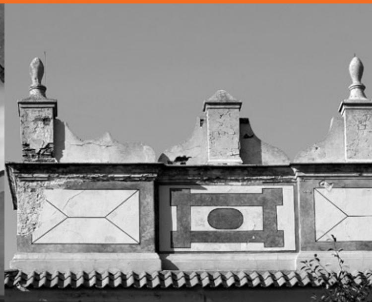
The attic of the Old City synagogue