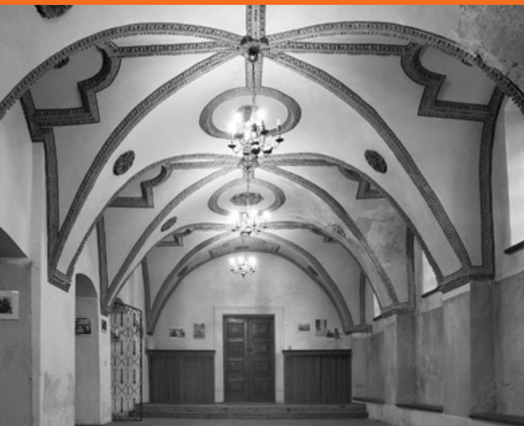
The northern annex for women in the Old City synagogue