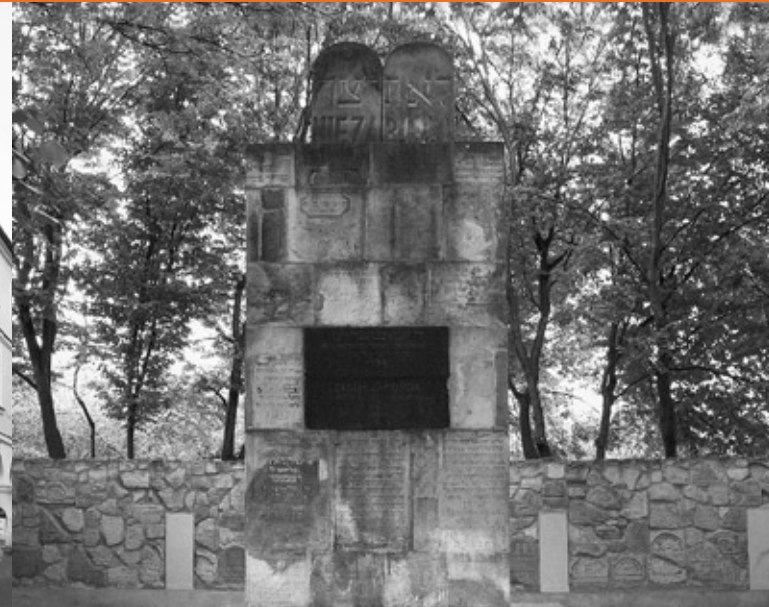
The monument commemorating the Zamosc Jews on the new cemetery

had also 9 libraries, 4 bookshops and 3 big printing houses. Apart from lay schools there were also religious ones, mostly traditional cheders, as well as a small yeshiva.