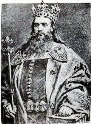
Kazimierz the Great

At this time the social order in Poland was organized into six castes or estates: the Crown, the nobility (called the “ szlachta ”, consisting of landed as well as landless gentry), the clergy, the burghers (primarily German and Polish merchants) and the peasantry. The Kalisz Statutes created a sixth estate, the Jews. 1 Membership in each estate was primarily determined by heredity and each caste was granted specific legal rights and privileges.