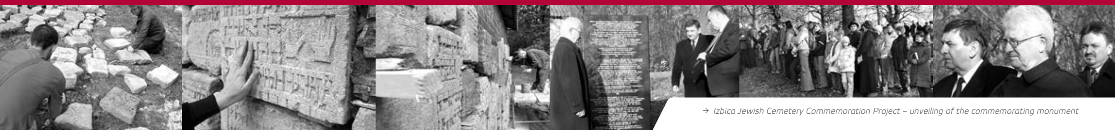
→ Izbica Jewish Cemetery Commemoration Project – installing the matzevot at the ohel walls

Overpopulation and hunger were enormous. Because the town had no hospital, the synagogue was transformed into one.