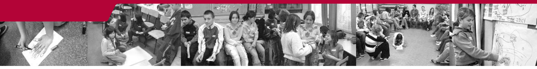
→ Izbica Jewish Cemetery Commemoration Project – workshop on Jewish culture for the students in Izbica